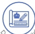
Design & Build